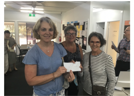
Caloundra Pairs B Grade Winners 2021