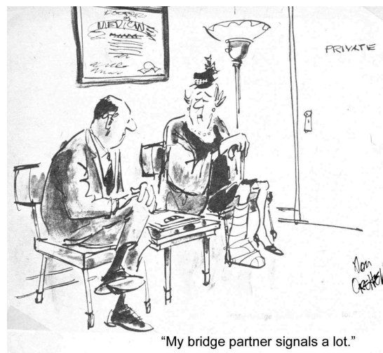
"My bridge partner signals a lot."

All Eclectic results are calculated on individual results.'