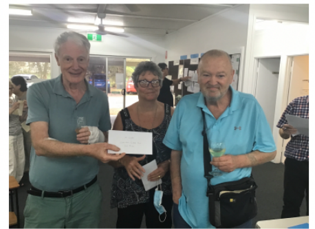
Caloundra Pairs A Grade Winners 2021